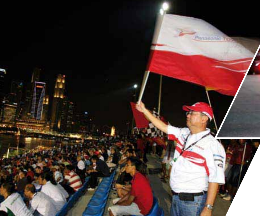
Flying the flag at the Bay Grandstand