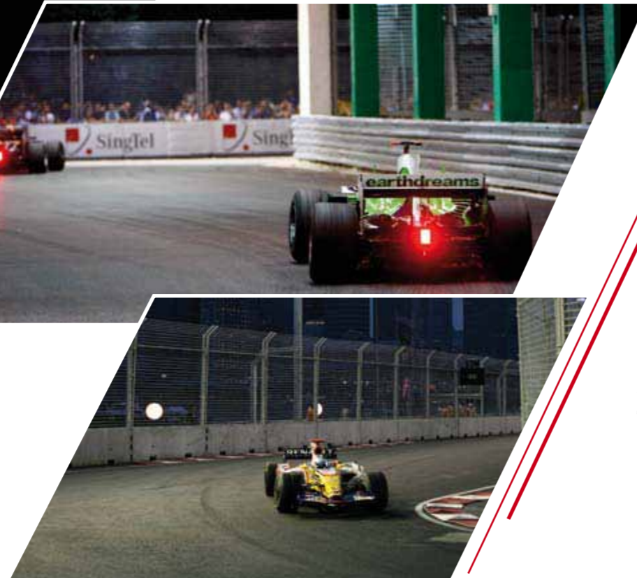
Fernando Alonso negotiating Turn 18