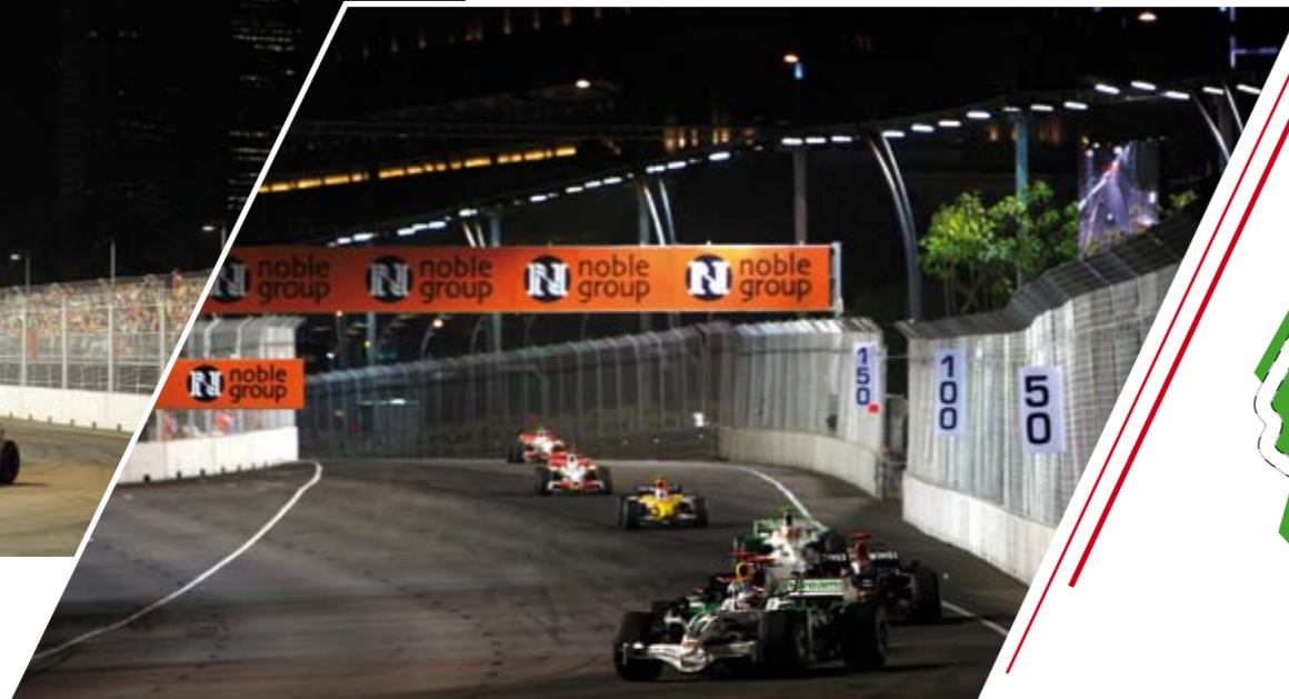
Robert Kubica of BMW Sauber takes on Turn 14