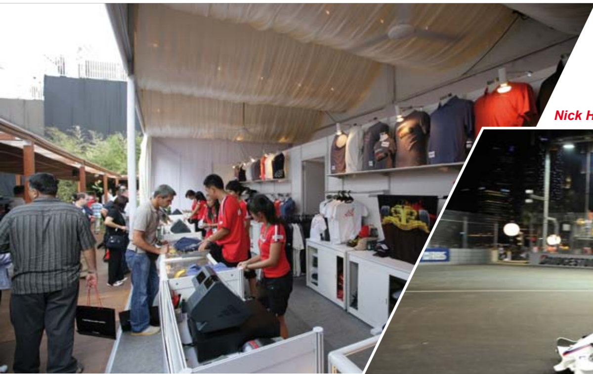
Nick Heidfeld of BMW Sauber negotiating Turn 17