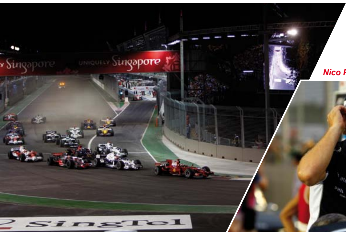
Plenty of action at The Turns