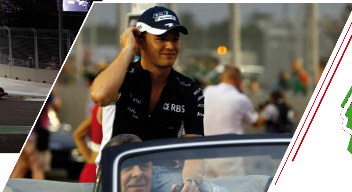
Nico Rosberg on the driver's parade