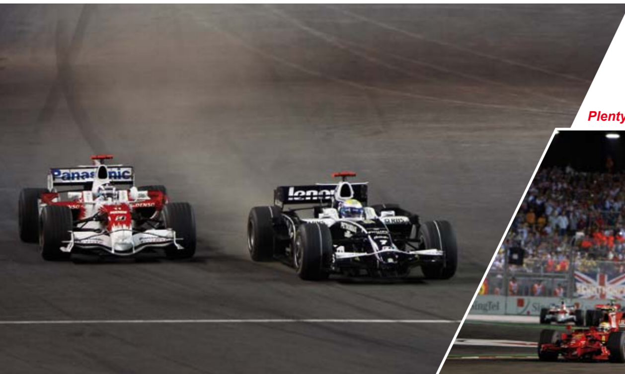
Plenty of action at Turn 2