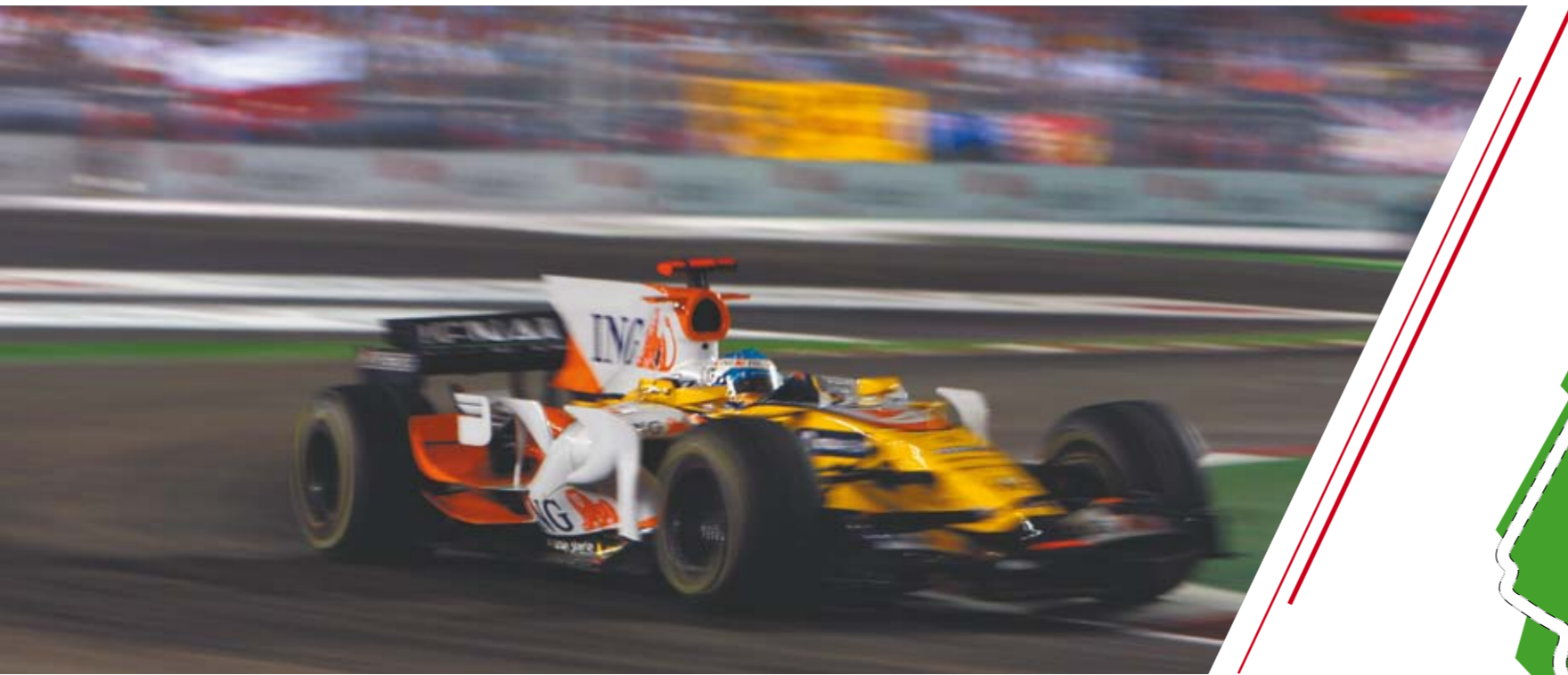
Fernando Alonso at Turn 3